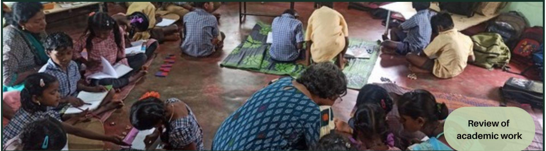
Review of academic work