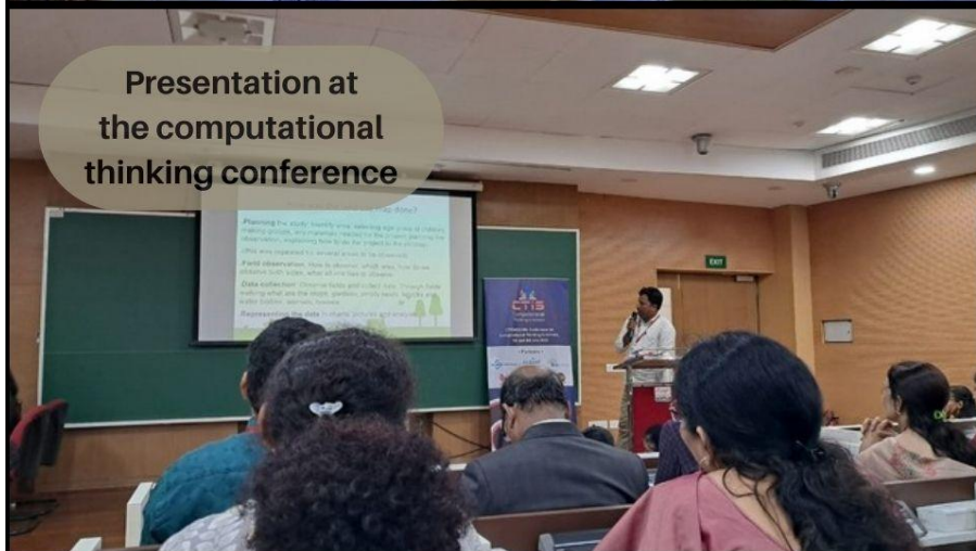
Presentation at the computational thinking conference