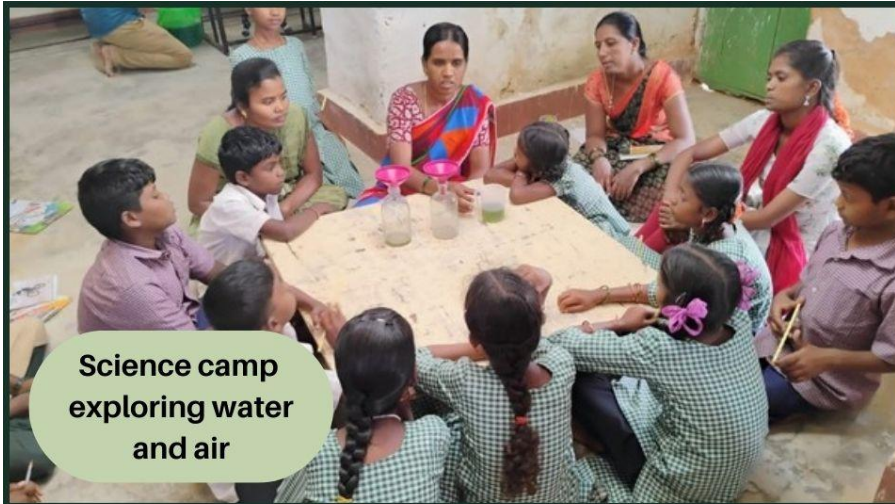
Science camp exploring water and air