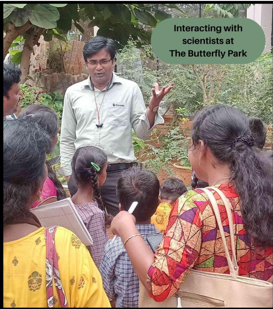
Interacting with scientists at The Butterfly Park