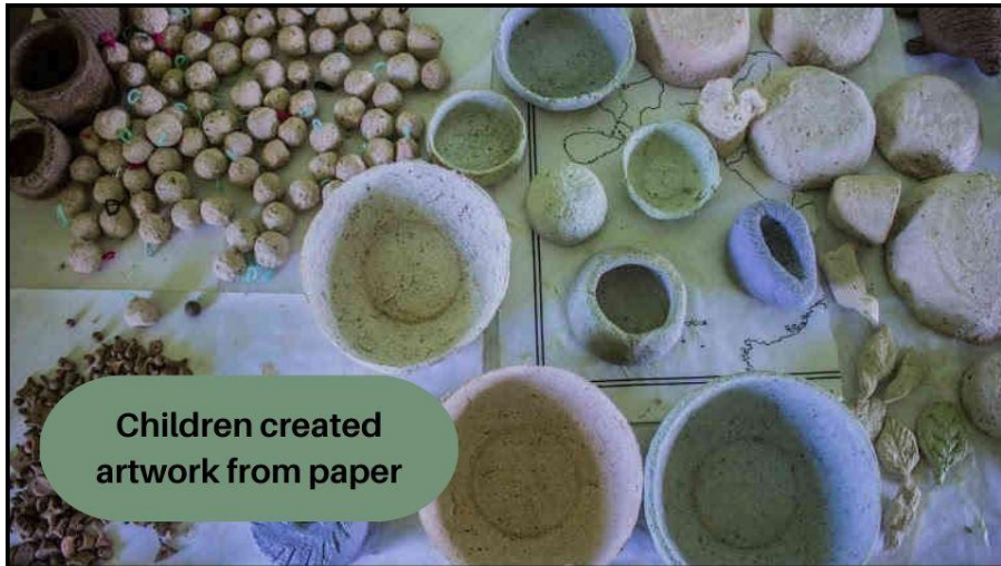
Children created artwork from paper