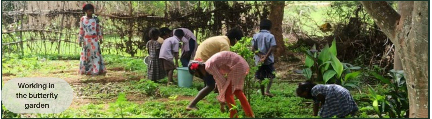
Working in the butterfly garden