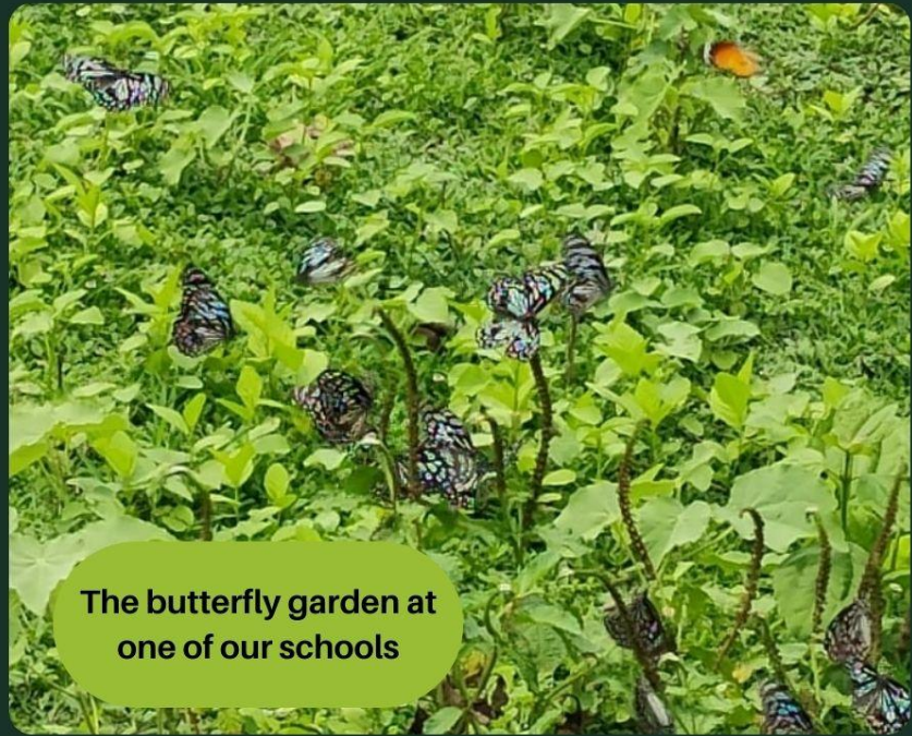
The butterfly garden at one of our schools